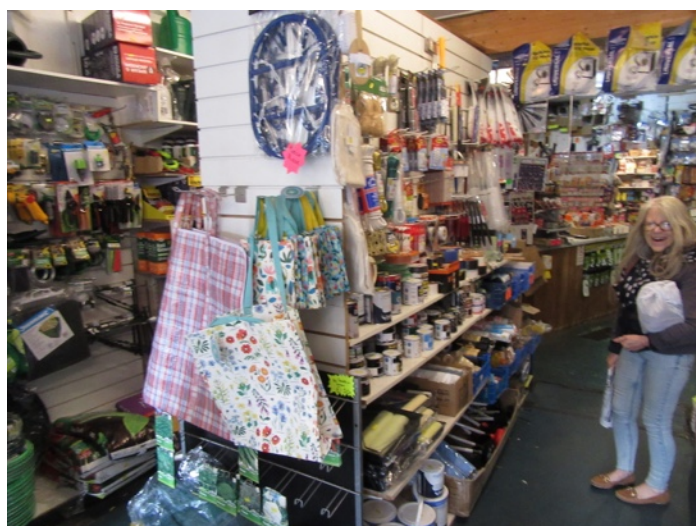
Inside the 'Aladdin's Cave' of Southdown Hardware.