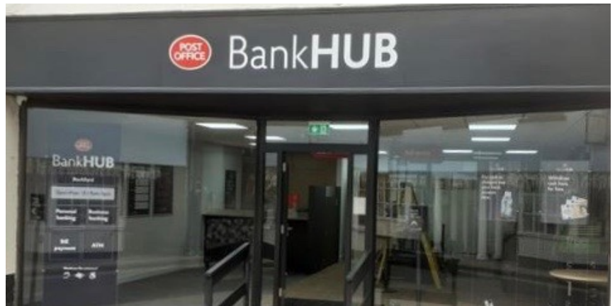
How a bank hub in Harpenden High Street might look; this one is in Rochford, Essex

For Harpenden, which faces the imminent closure of Barclays, leaving HSBC as the only major bank in the town, a bank hub would make eminent sense. Plans are afoot to turn the present – and historic – Barclays corner-site building into three shop units, one of which