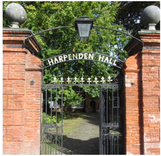
Imposing entrance gate hints at former eminence