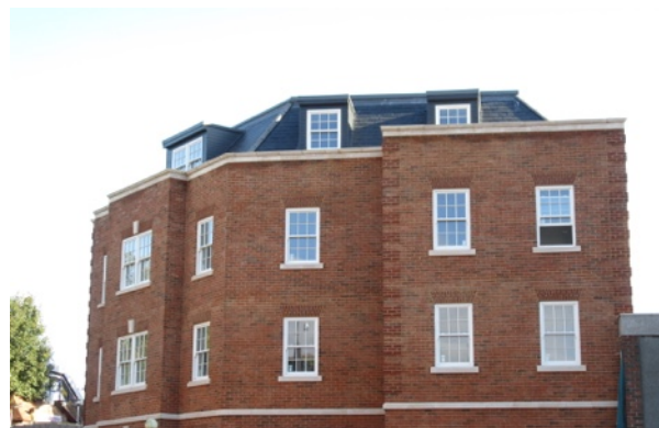
Two possible contenders for 2022 Awards.