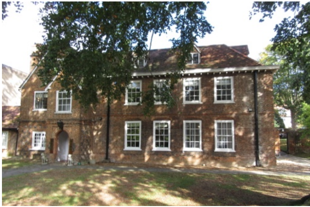
Harpenden Hall, pre-1974 home of the town's Urban District Council

Tall trees, a boundary wall and an extensive area of greensward are nowadays apt to shield historic Harpenden Hall from view, at least from the perspective of anyone approaching the town from across the Common. However, once inside the ancient front gateway the building's venerability is apparent, especially in relation to the adjacent and strikingly more modern (though now destined for demolition) Public Halls.